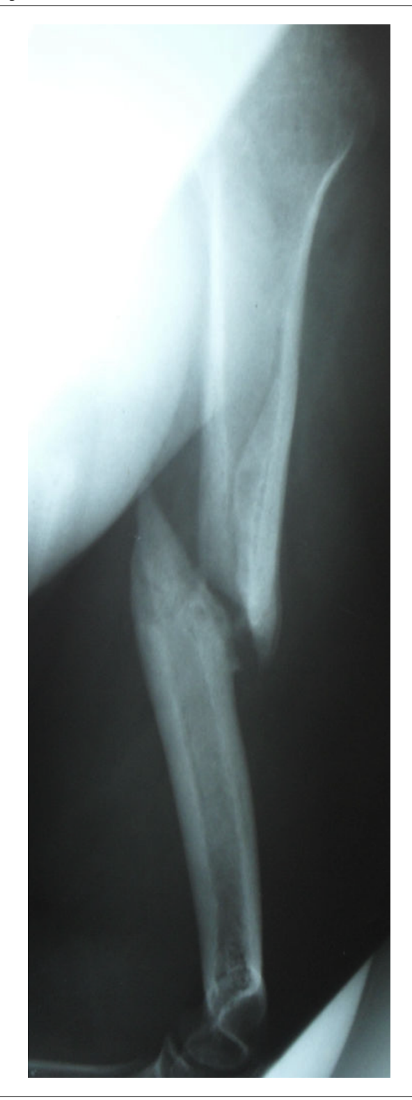
Figure 1. Humerus in Lateral View