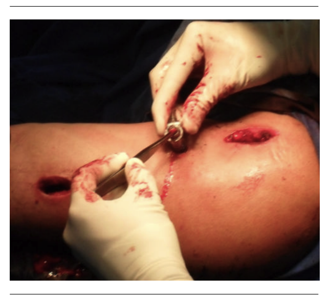
Figure 4. The Bone Graft is Inserted into the Atrophic Nonunion Site Through the Canula.